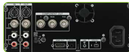
HVR-M25E Rear panel