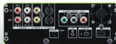
HVR-M15E Rear panel